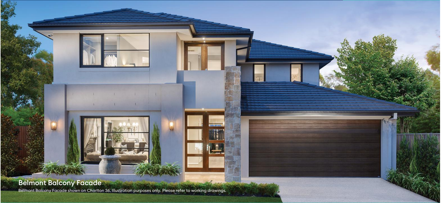
Belmont Balcony Facade

Belmont Balcony Facade shown on Charlton 36. Illustration purposes only. Please refer to working drawings.